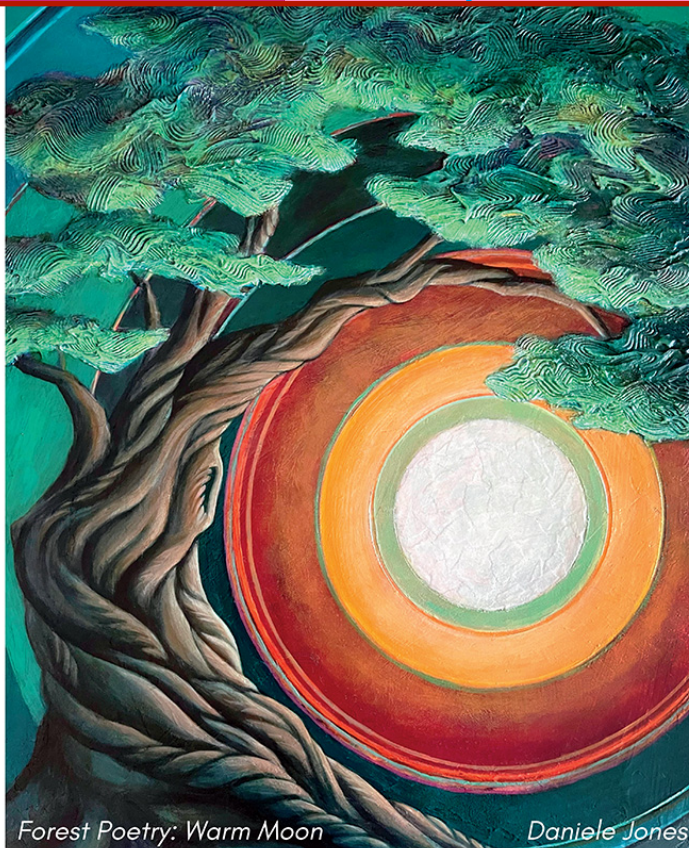
Forest Poetry: Warm Moon

You can view the installation from 2-8 p.m. on Saturday, February 3 with live poetry readings. The event will be held at the Cove, 403 N. Tennessee St., McKinney. Art Meets Poetry is free, but donations and an art raffle will benefit three food security charities in McKinney. Reserve a room at the Springhill Suites and make a weekend of it! Call 888-236-2427 for a reservation.