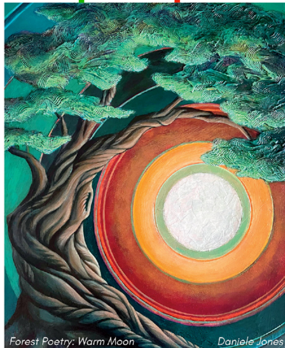
Forest Poetry: Warm Moon

Your PST dues includes membership in the National Federation of State Poetry Societies. The latest issue of Strophes, the NFSPS newsletter is on their website. Strophes is no longer mailed to PST so you have to go online if you want to see it or print it if you want a copy.